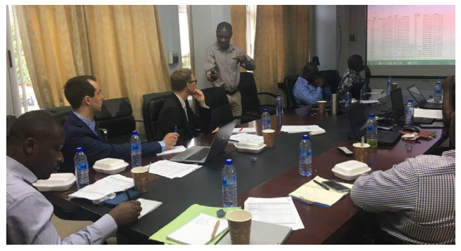
On mission in Accra, Ghana.

supported the process of using new software for the calculations. The Ghanaian CPI is still based on the old regional structure (10 regions). We have been asked to support them in the process of changing the calculations to be based on the new 16 regions.