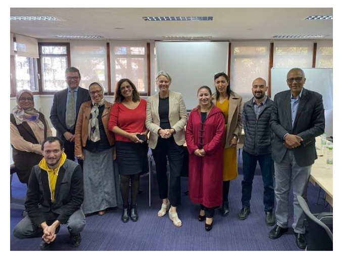
Group photo from the mission to Rabat, Morocco

During 2022, lots of ongoing activities will continue and new ones will start. Moroccan, Danish and Norwegian experts will collaborate to modernize the Statistical Business Register, using a generic system developed by the Norwegian NSI (SSB). The new register will enable HCP to compile more detailed and solid information on Moroccan businesses – an activity that was postponed to 2022 due to Covid-19 travel restrictions to Morocco. In 2022, we will also focus on the green component of the project where experts from SD together with the Danish Environmental Protection Agency (DEPA) will support HCP in the process of generating statistics on access to water in Morocco. An important activity feeding directly into SDG reporting and monitoring