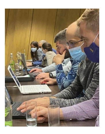
Geostat staff during R training.

Among many other things, I want to mention that Geostat at the end of the project employed two new people for validation of data from their new survey on Interna-