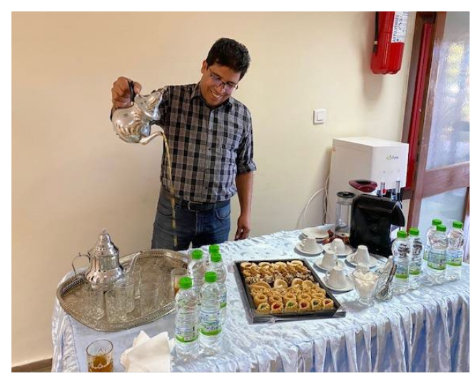
Preparations for tea break in between sessions

Nothing has actually surprised me much in the cooperation with my Moroccan colleagues. I have enjoyed working with them. We have had good discussions that have led to some very fine results this far in the project and I have brought back with me good ideas on how to make changes to some of our processes in Statistics Denmark. For me there is no doubt – the physical meetings are much more fruitful than meetings on Zoom. They give the possibility to get a feel for the culture and the way the society functions which the coffee breaks and the stay in the country contributes substantially to in addition to the actual (physical) meetings ■