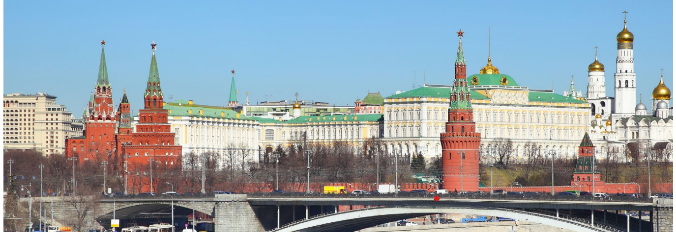
The Cremlin, Moscow.

Trainings were held on several topics including sector accounts on environmental goods and services, enterprise group profiling, tourism satellite accounts, and input-output tables