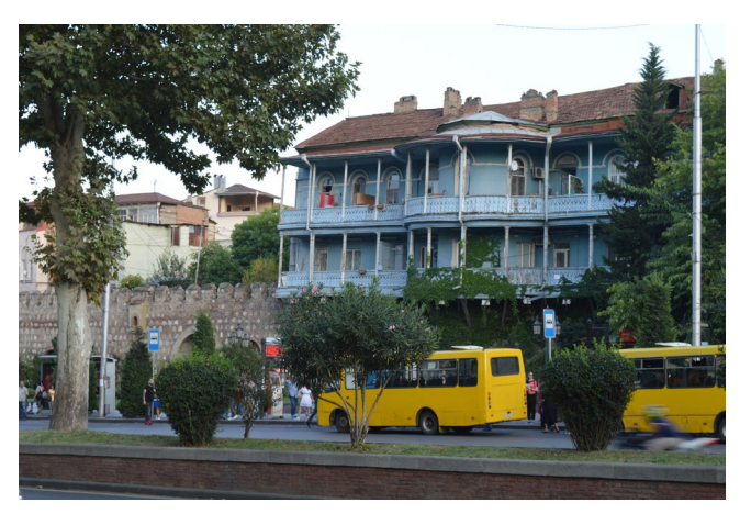
On mission in Tbilisi, Georgia.

tional Trade in Services. All the way through the project, we were stressing the importance of close company contact and data validation due to the conceptual complexity of Trade in Services. So when Geostat in the end managed to find resources for an intensified effort in this area, it really felt like a step forward.