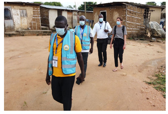
Data collection for the Housing & Population census

Since 2019, we have helped Ghana Statistical Service (GSS) in updating their consumer price index (CPI): we have implemented a new basket of goods and services into their CPI, assisted GSS in changing and updating the index calculations underlying their CPI and