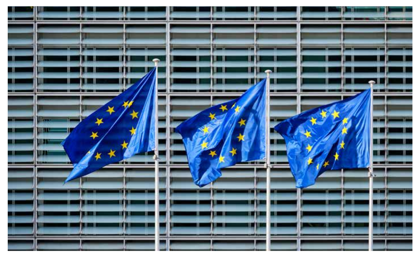
EU Commission, the Berlaymont building, Bruxelles

A major tool in Twinnings is study visits to member states. The visits demonstrates how the same statistical products based on a common methodology can be produced in different ways using different IT technologies. Another important aspect is to sensitize the participants to European civil service cultures and ethics