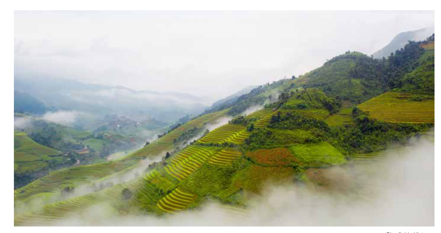
Rice fields, Vietnam

Since the project is scheduled to finish by the end of 2024, the focus for 2024 will be on finalizing the work done within the four subjects as well as designing strategies for a sustainable exit of the project. In total nine missions in Hanoi and two study visits to Statistics Denmark are scheduled to take place during 2024