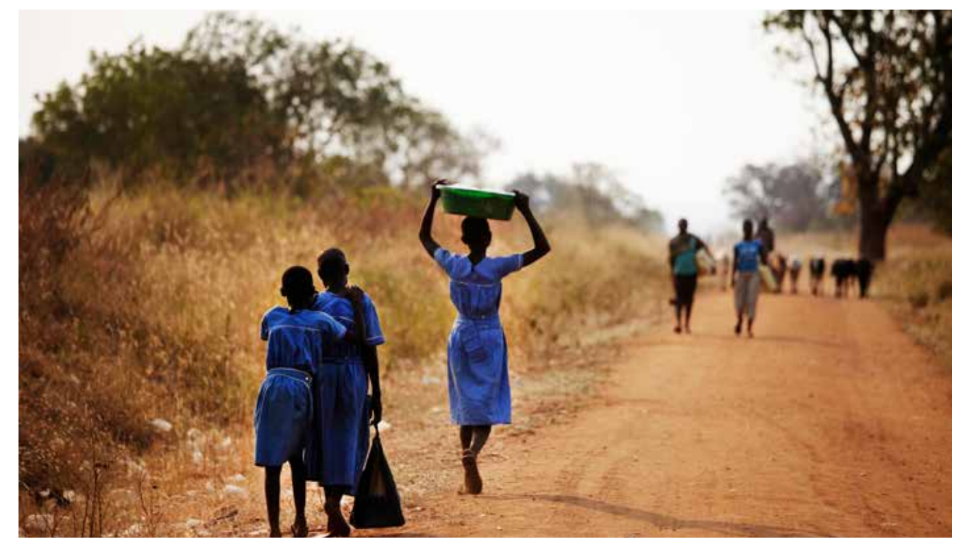
African girls in their school uniform walking on a dusty road

It is also planned that the support to the component on labour force surveys led by INSEE will continue and possibly result in a new collaboration with a fifth partner NSI. Finally, close coordination and collaboration with the other consortium partners and with other relevant stakeholders such as UN ECA and StatAfric will continue to be a focus to prevent duplication, to learn from each other, and to work together on strengthening the African statistical system