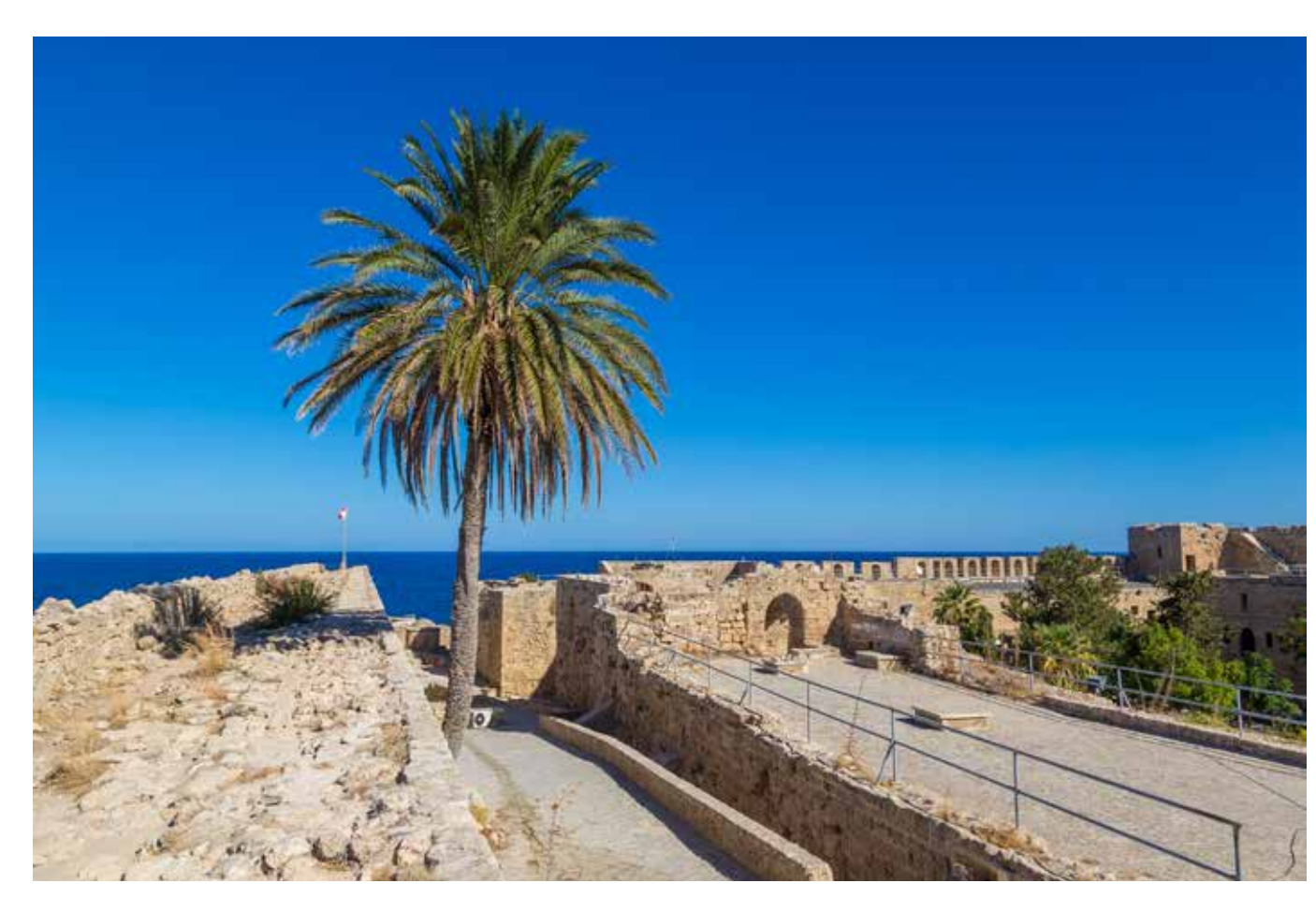
Castle ruins, Northern Cyprus

The project will continue to mid July 2024. In 2024 the focus will be on finalizing the business register and strengthening and systemizing the data flow to the TCC Statistical Institute from relevant stakeholders. This entails further steps towards signing MoUs