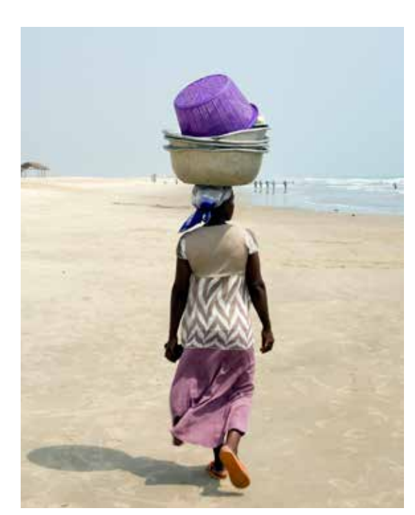
Woman on the beach, Ghana

GSS with support from experts from Statistics Denmark developed a document outlining a data quality framework aimed at ensuring uniformity in data collection methods and methodologies across Ghana.