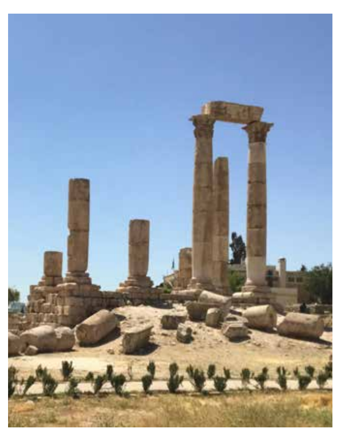
Amman Citadel, Jordan

In 2024 the project will focus on achieving tangible and sustainable mandatory operational results based on the lessons learned in 2023 in all components of the project