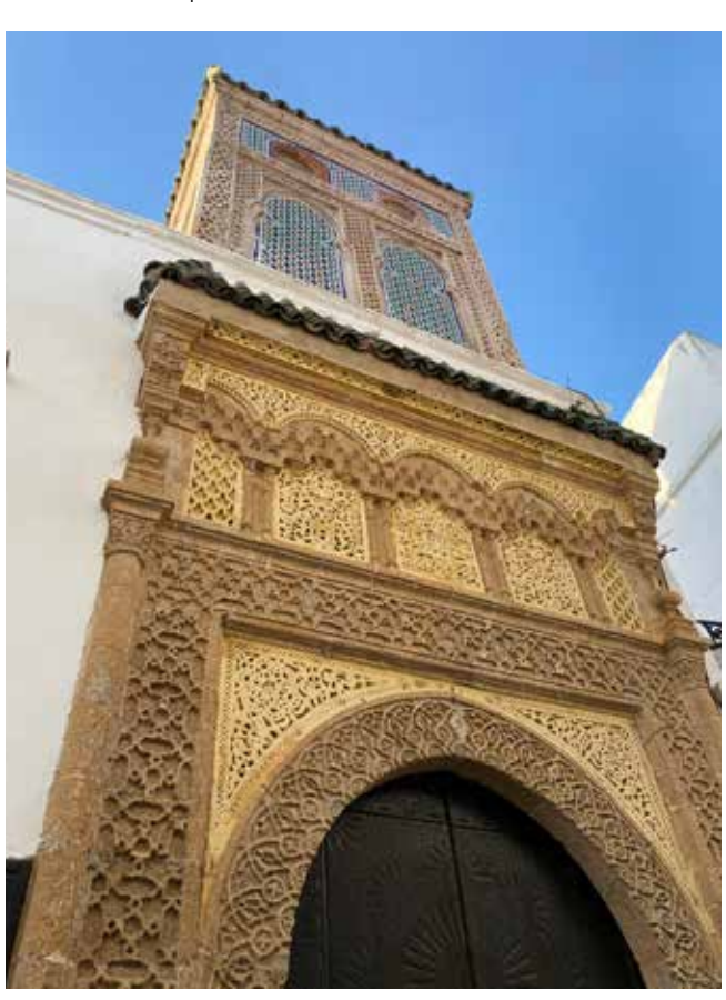
Tower in the Kasbah in Rabat, Morocco

Emphasis will therefore be put on activities already initiated such as the water account, the business register and quality management. But we will also introduce a new activity aiming at establishing an economic modelling tool similar to the Danish macro-economic model ADAM. The modelling tool will be used to predict economic development trends and calculate the effects of economic and political interventions in Morocco